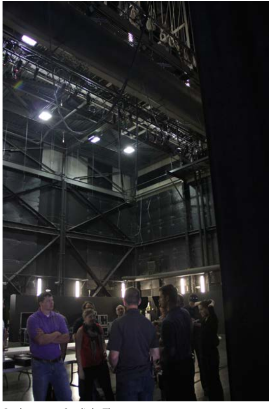
Back stage at Starlight Theatre.