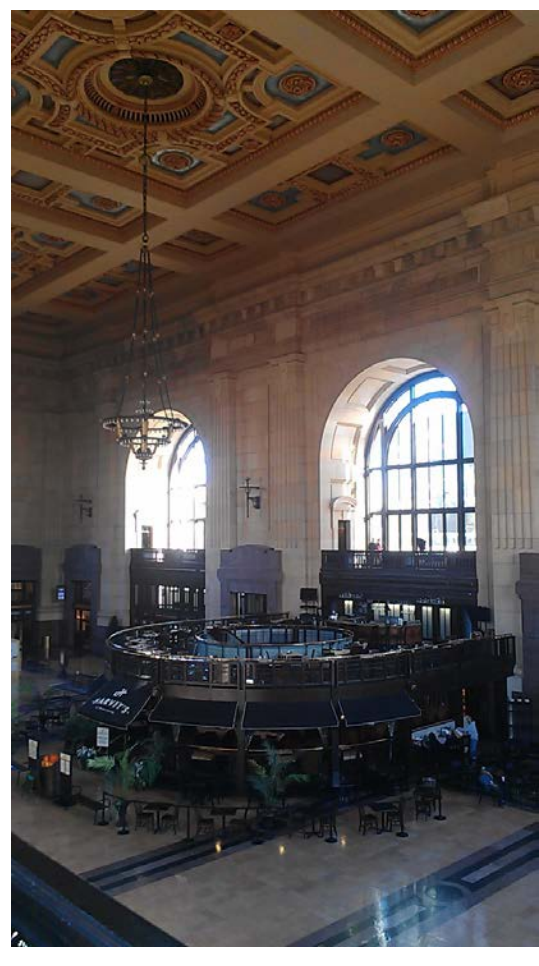
Harvey's at Union Station repurposed the orginal ticket booth in the East Hall as a restaurant and bar.