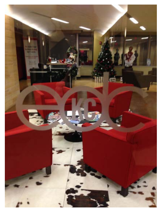
A warm reception for the Pillars group at the EDC in conjunction with the Greater Kansas City Chamber of Commerce.