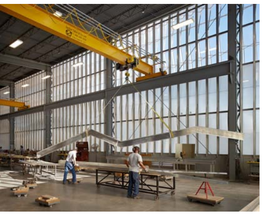
A. Zahner's new world class fabrication shop addition which allows for easy manuvering of large objects. They favor unitized construction for ease of installtion once on the jobsite. So many of their project are international as much work that can be done in a controlled environment the better.