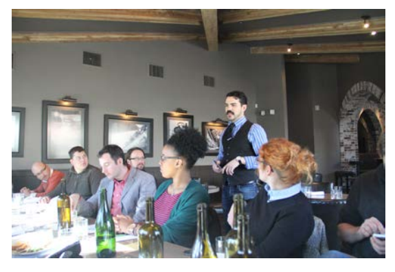
Gram & Dun - Bread & Butter Concepts