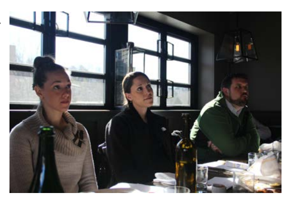
Enjoying a meal during restaurant week at Bread and Butter Concepts fine dining restaurant Gram & Dun on the Plaza. Comfort foods were a plenty during lunch while we enjoyed hearing about the history or how Bread and Butter Concepts came to be.