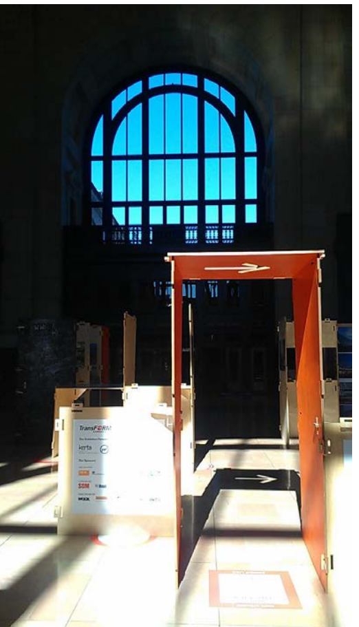
The entry to the TransFormKC Exhibit / Transit Map.

We came away from our session with a better understanding of how Kansas City's transit systems have come to be, where they are heading in the future and the impacts they can have on our city and region. More importantly we all understand the impact we can have on the future of our city by becoming involved in the discussions of our public transit systems and applying our particular knowledge and design skills to shape its future.