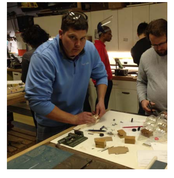
Intensity of Creation