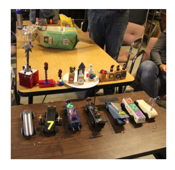
The Constructs & the Awards