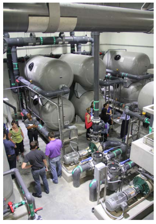
Exploring the Penguin exhibit pump room.

Following our backstage experiences we were ready for some after partying. We made a quick pit-stop at the new Waldo brewery and beer garden Kansas City Bier Company, before wrapping up our afternoon in heart of Waldo snacking on "Turbo Tots" at Lew's. Kansas City Bier Company is a new local microbrewery, with a pub atmosphere, great t-shirts and other swag merchandise, fit for any bier lover.