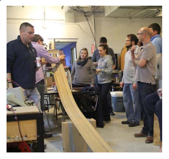
Off to the Races